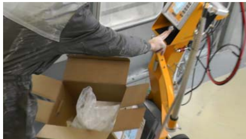
Step 4: Start the cleaning process