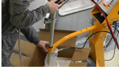
Step 2: Raise the suction tube