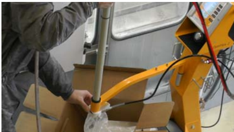
Step 3: Position the QuickClean module