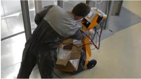
Step 1: Activate the air mover