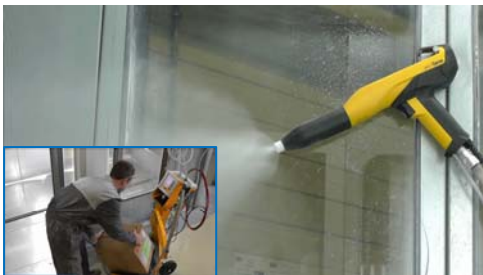
Step 5: Change the powder box during automatic cleaning